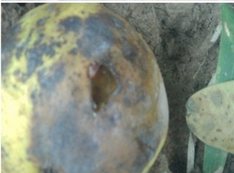
Affected mango fruits by fruit fly