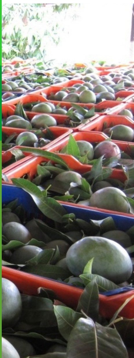
Mangoes after harvest: source www.ssgadvisors.com