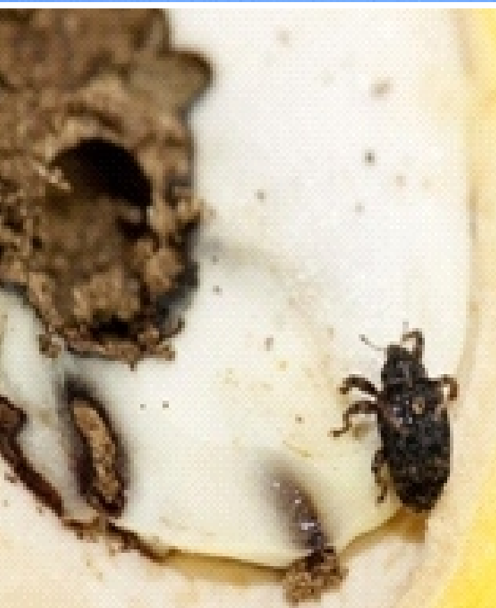
Affected mango fruits by fruit fly

Adults are active at dawn and dusk feeding on new flush. Adults shelter under rough bark on the trunk and the main leaders. Egg of the weevil hatch and larvae enter the seed.