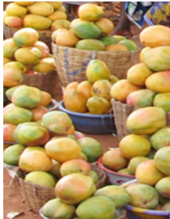
Mango being sold in a market