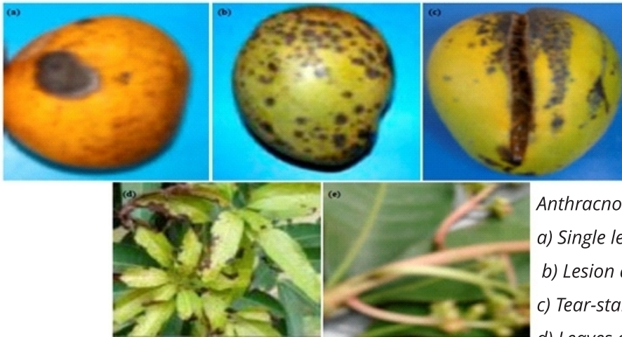
Anthracnose symptoms on; a) Single lesion on ripen fruit b) Lesion allover fruit surface c) Tear-stain pattern d) Leaves and, e) Early infection on a panicle