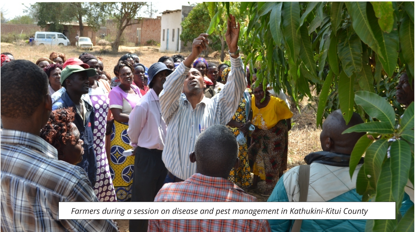
Farmers during a session on disease and pest management in Kathukini-Kitui County