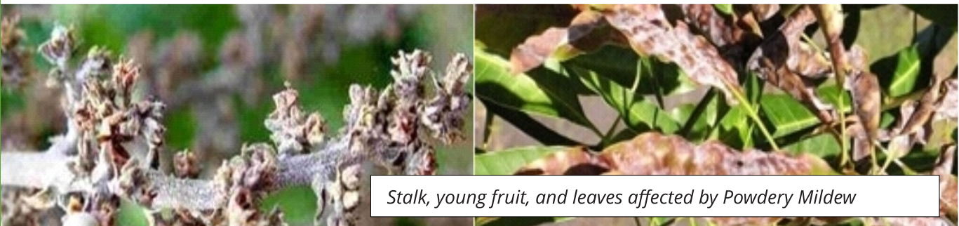
Stalk, young fruit, and leaves affected by Powdery Mildew

Other diseases include the Scab, leaf spot, gall, and the deficiency of Calcium among others.